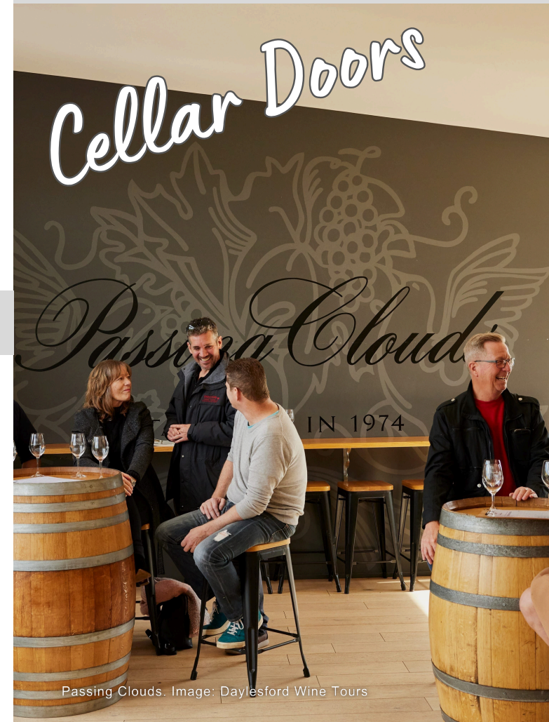
Passing Clouds.

Nestled amidst rolling hills and tranquil bushland, Hepburn Shire's cellar doors offer a taste of the finest cool climate wines in Victoria. Explore boutique vineyards where passionate winemakers craft small-batch vintages with care and expertise.