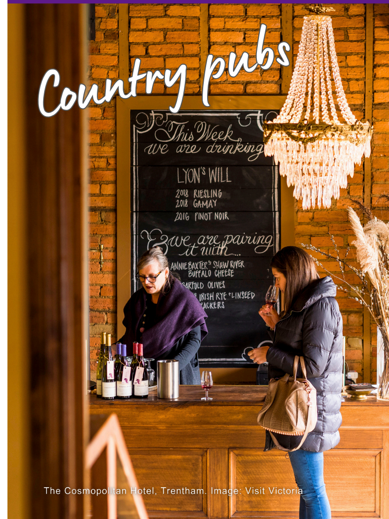
The Cosmopolitan Hotel, Trentham.

Country hospitality is second to none, and you'll find it in spades in Hepburn Shire's many classic pubs. They're packed with character and ready to welcome you.