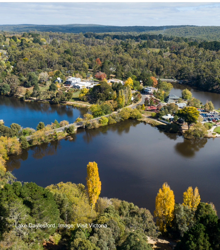
Lake Daylesford.

Walking distance from Visitor Centre: 0.7 km