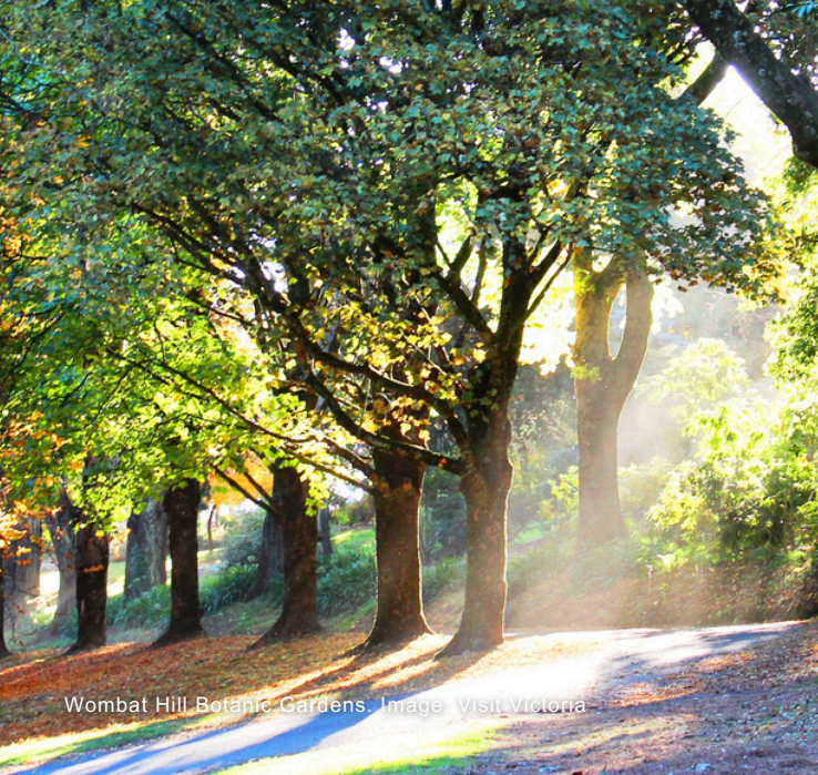
Wombat Hill Botanic Gardens.