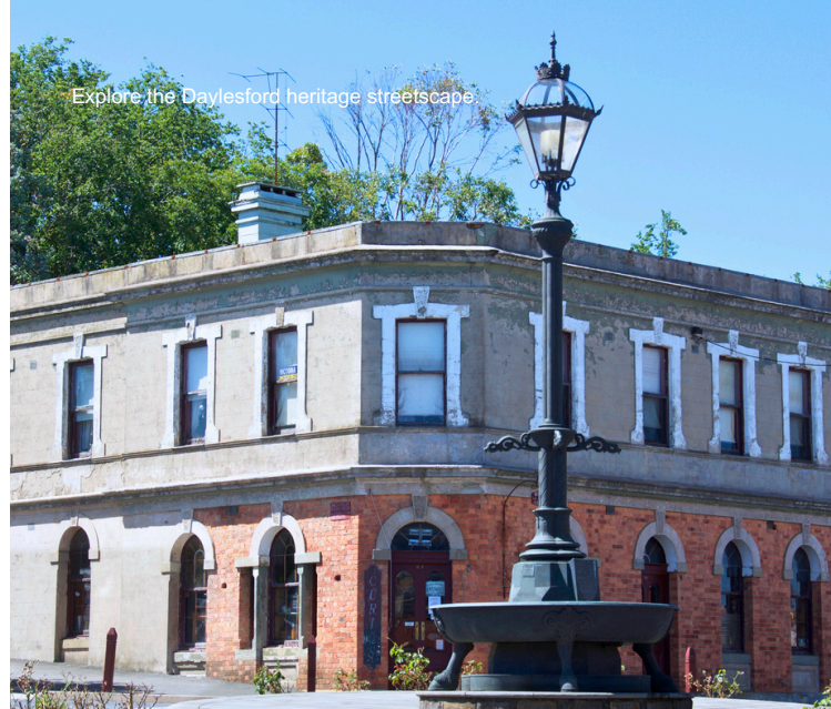
Explore the Daylesford heritage streetscape.